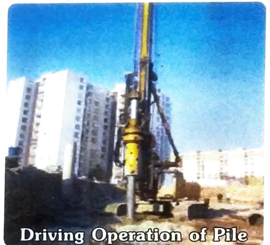
Driving Operation of Pile